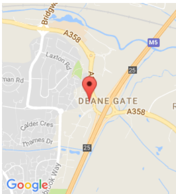
( https://maps.google.com/maps?ll=51.018359,-3.065612&z=14&t=m&hl=en-US&gl=US&mapclient=api3 )

Something changed? (/contact/something_changed?destination=/access-guide/kew-green/holiday-inn-taunton-m5-jct25)